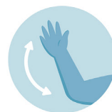
Upper Limb Mobility